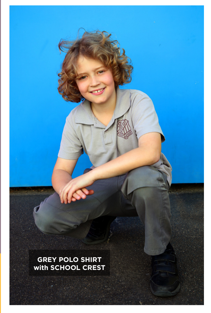
GREY POLO SHIRT with SCHOOL CREST