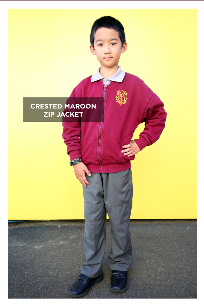
CRESTED MAROON ZIP JACKET