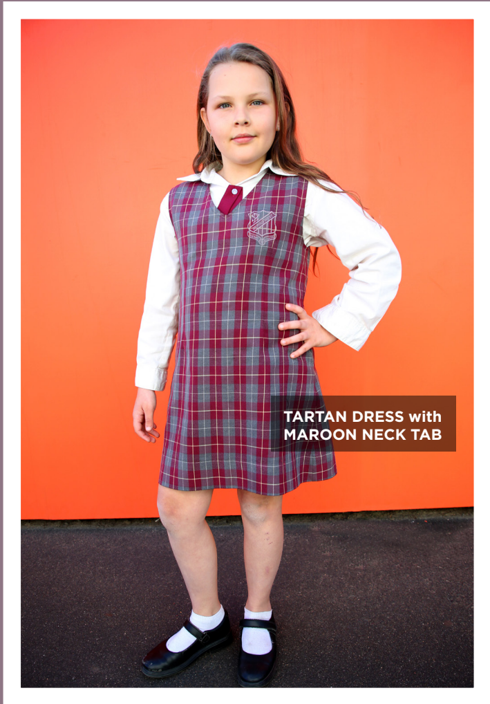
TARTAN DRESS with MAROON NECK TAB