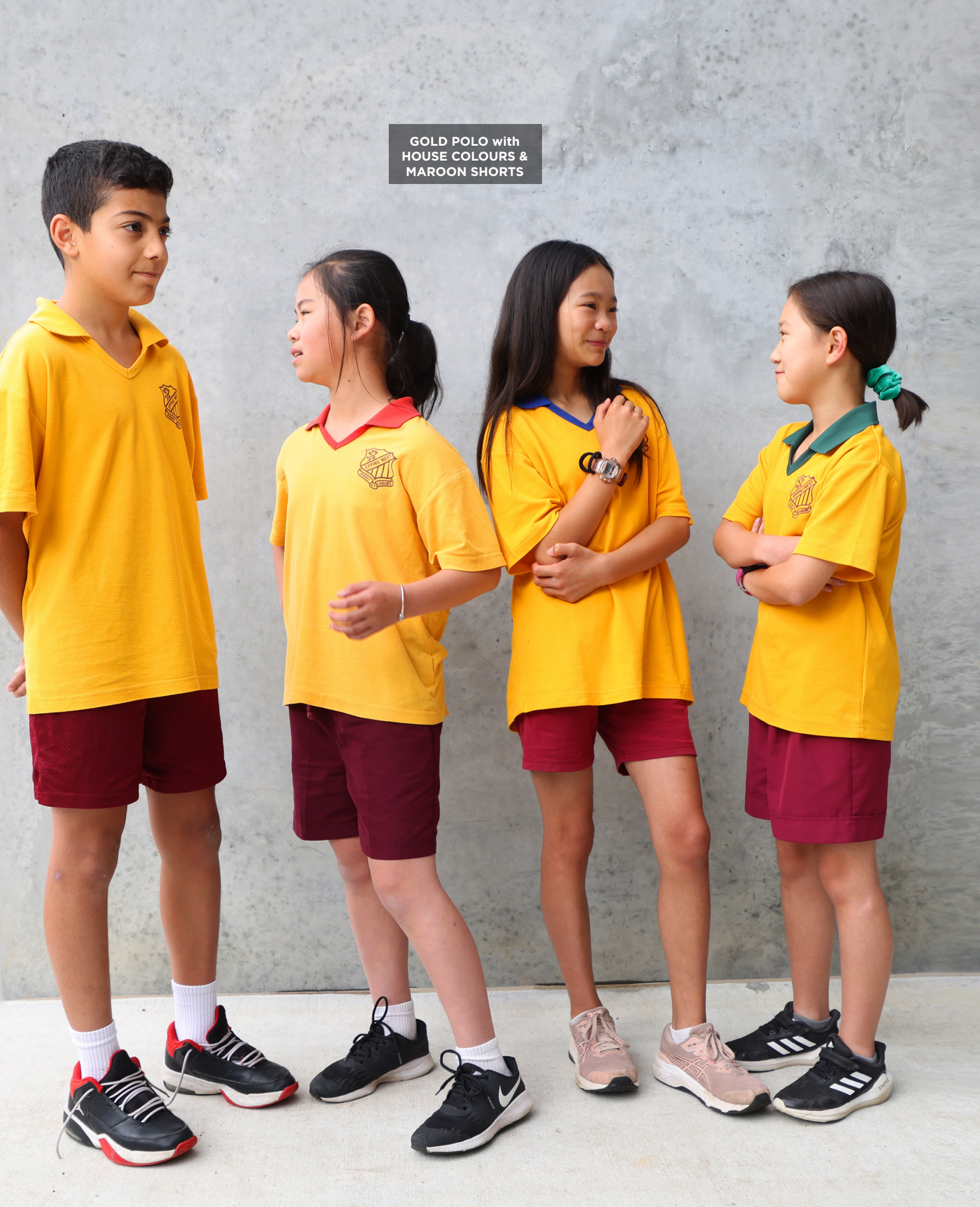
GOLD POLO with HOUSE COLOURS & MAROON SHORTS